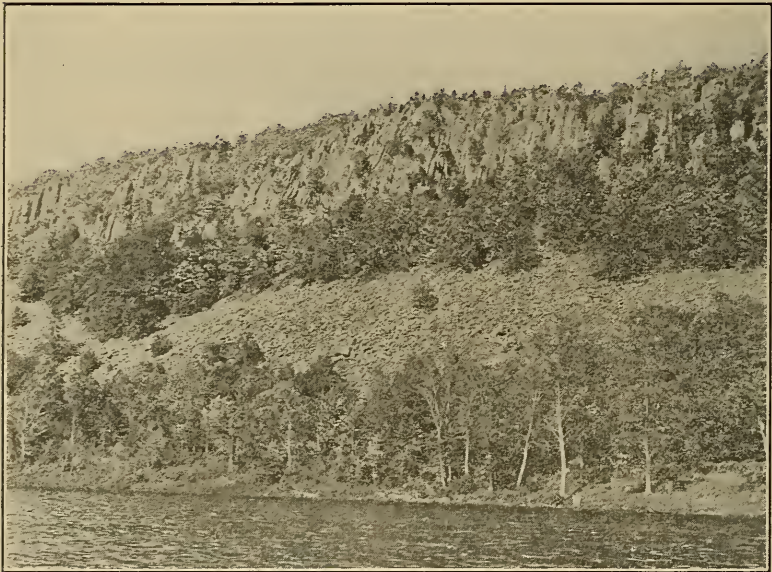
FIG. 4. Talus slope along west face of West Rock ridge, Woodbridge. A short distance to the north of where this picture was taken the talus has become completely covered with forest.

east, and it is largely from a study of the vegetation on these slopes that the observations thus far recorded have been made. But toward the west the ridges terminate in perpendicular cliffs, at the foot of which are great masses of rocks waste (fig. 4) or talus, derived from the disintegration of the overhanging precipices, and sometimes these are so extensive as to completely bury cliffs several hundred feet in height. The upper part of such a talus slope is steep, and, except at the very foot of the cliff, is composed of large, loose blocks of rock, with practically